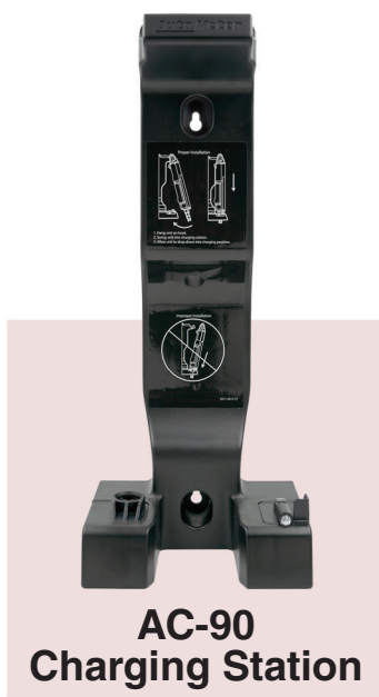
AC-90 Charging Station